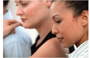
Add a different face to genetic counseling.

Consulting with a genetic counselor is an intensely personal experience. It demands a special bond of trust and understanding – the kind of bond that comes from belonging to the same community. Unfortunately, only 3 percent of genetic counselors in the United States are African-American or Hispanic. That's not enough. You have their trust. Now, you can become a trusted resource for your community.