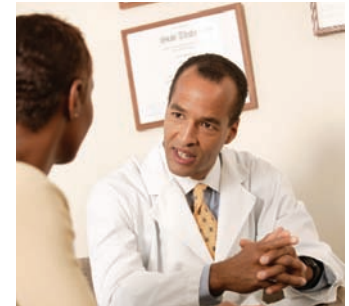
Genetic counselors and physicians work together to make a difference.