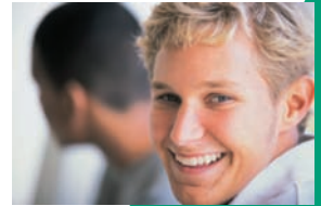
Take advantage of unique opportunities.

There are a variety of career settings that serve many different people. You could focus on cancer screening at a private practice. Or maybe you would prefer to counsel expectant parents at a community clinic. New and different opportunities regularly become available. Choose a path or create your own.